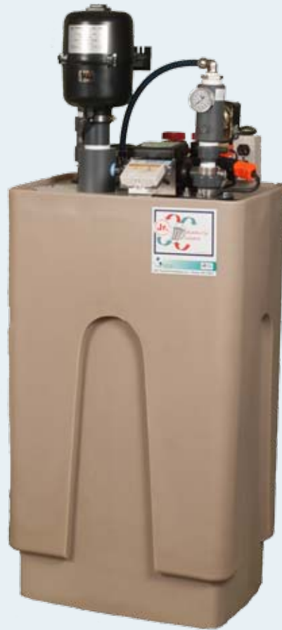
Bubble-Up® Jr. Interactive™

Building on the advantages of compact size, 99% efficiency, quiet operation, high pressure, and clean, neat installation, R.E. Prescott Company has added safety features with the REPCO Meter Control and the REPCO Water Alarm Valve.